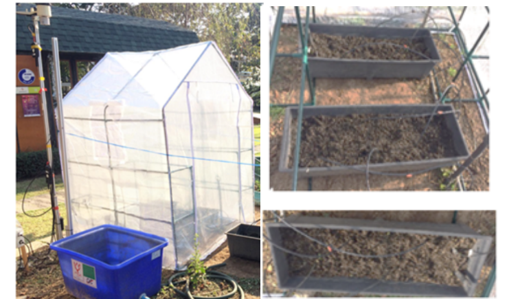
Figure 4: Sensors installation in greenhouse for data collection

The sensor data collected is analyzed rule-based to provide an appropriate recommendation to management during its lifecycle. Farmers can monitor sensor data and manage the lettuce lifecycle, such as irrigation, fertilization, etc., via the Line chat application. Based on the implementation, farmers are pleased with the proposed system for managing lettuce production, with a total satisfaction rate of 96%, as shown in Table 4.